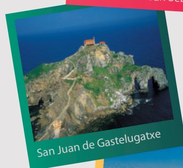
San Juan de Gastelugatxe